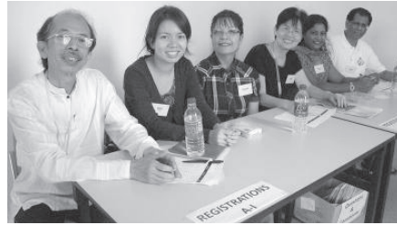
The CDM Meditation Group helping out at with the registration.

**Interested in attending the next meditation session? See page 3 for more details.